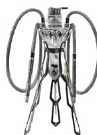
MEDUSE PRINCE 130