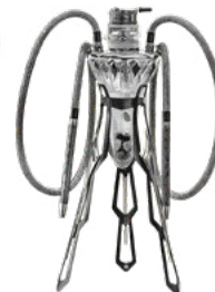
MEDUSE PRINCE 130